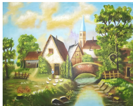
DRASHTI THAKKAR 5 th SEM CHEMICAL