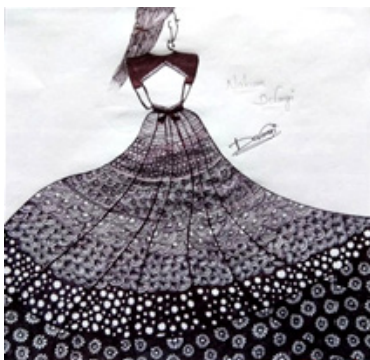
NAKUM DEVANGI 3 rd SEM I&C