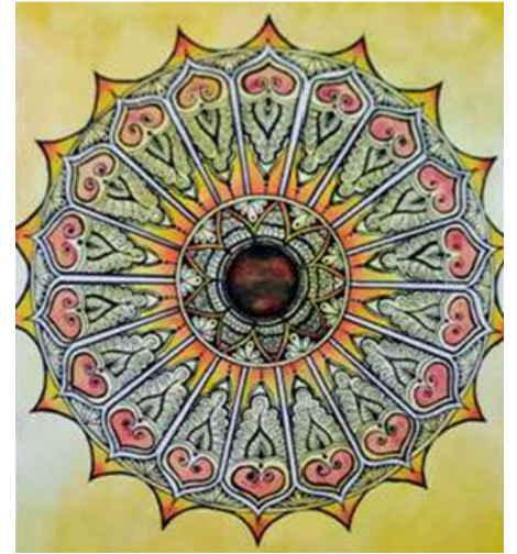
CHARMY PATEL 3 rd SEM CE