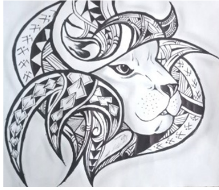
MANSI PANCHAL 5 th SEM CE