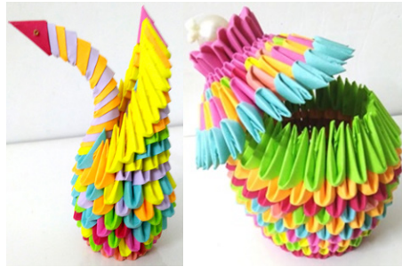
DISHA SUTHAR 3 rd SEM CE