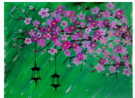
SAKSHI PATEL 8 th SEM IT