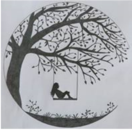
DHRUVI DHAPRE 3 rd SEM CE